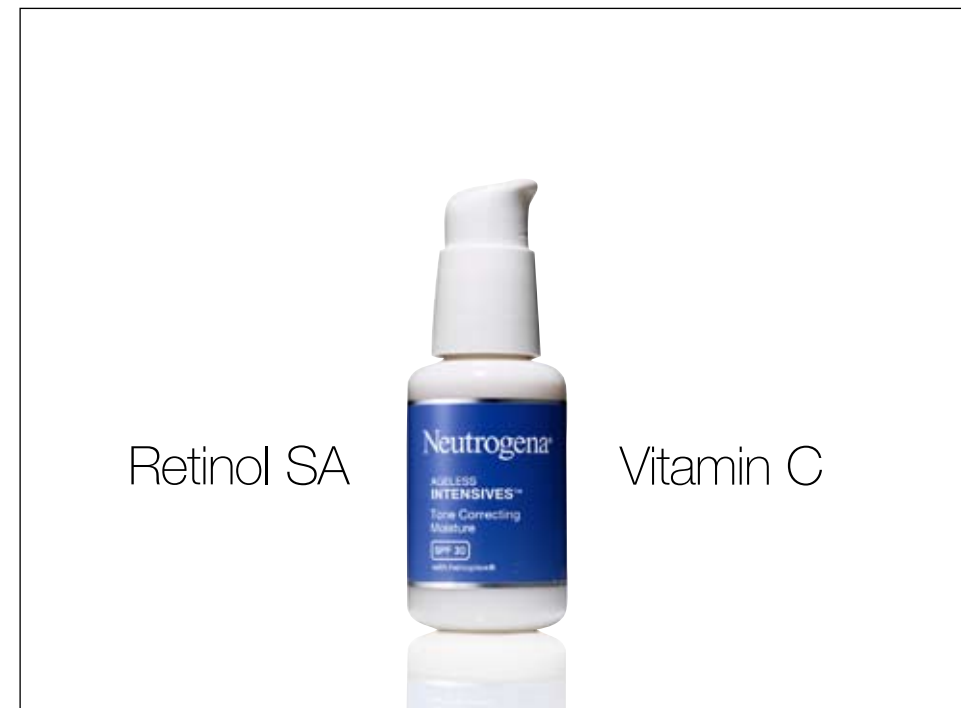
Use it every day, and its powerful Retinol SA and Vitamin C formula