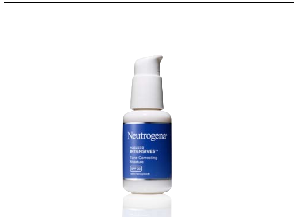
Neutrogena’s new Tone Correcting Moisture.